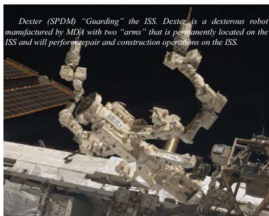
Dexter (SPDM) "Guarding" the ISS. Dexter is a dexterous robot manufactured by MDA with two "arms" that is permanently located on the ISS and will perform repair and construction operations on the ISS.