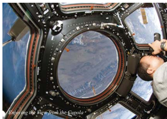
Enjoying the View from the Cupola