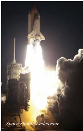
Space Shuttle Endeavour

130 was my second trip to Houston where I was providing support for the Canadarm in the NASA Mission Control Center at Johnson Space Center. It was another very exciting and humbling experience as I was surrounded by history and the enormous effort it takes to launch and operate a Space Shuttle. The control centre was very happy with the success, but the mood was also quite subdued as this will be one of the last launches of the Shuttle program, which will be retired in September 2010. Throughout the mission, I was mostly responsible