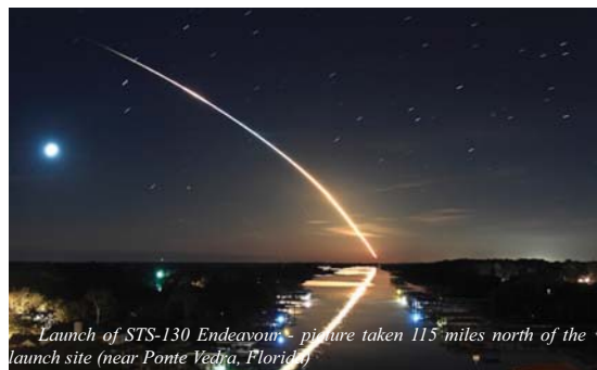
Launch of STS-130 Endeavour - picture taken 115 miles north of the launch site (near Ponte Vedra, Florida)

On behalf of all those who enjoyed reading it.