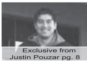
Exclusive from Justin Pouzar pg. 8