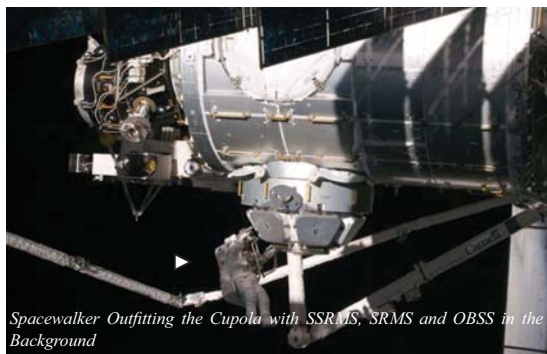
Spacewalker Outfitting the Cupola with SSRMS, SRMS and OBSS in the Background

There were three Spacewalks (pict. #4) during the Shuttle mission. The first was on Flight Day 5, when the Spacewalkers prepared Tranquility Node for installation onto the ISS. Following the Spacewalk, the Tranquility Node was installed onto the ISS using Canadarm2, which is permanently located on the ISS.