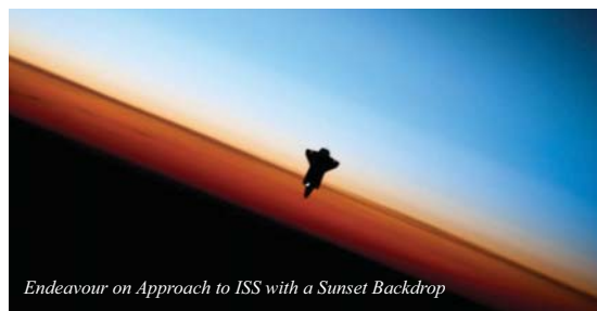
Endeavour on Approach to ISS with a Sunset Backdrop