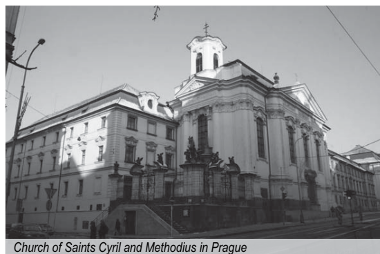
Church of Saints Cyril and Methodius in Prague

"On that day, when the Gestapo came here at 4:15, three of the soldiers were on the gallery. They opened fire at the German troops which lead to heavy fighting in the church. When they re-