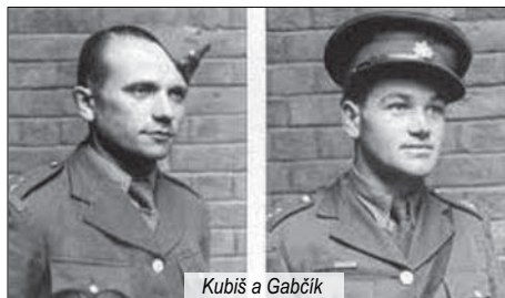
Kubiš a Gabčík